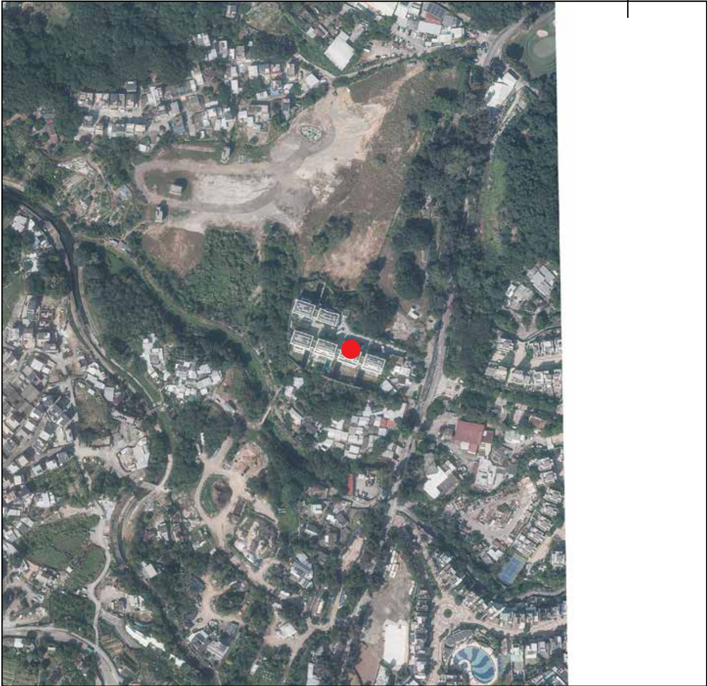
● Location of the Phase 期數的位置

This blank area falls outside the coverage of the aerial photograph 鳥瞰照片並不覆蓋本空白範圍